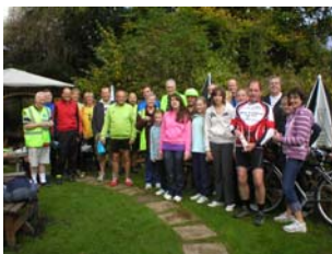
Solihull Cycling Oct 2012