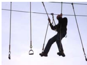
"Go Ape" April 2012