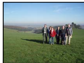
Canwell to Hopwas 11 miles Walk on Lovely Sunny day in Feb 2012