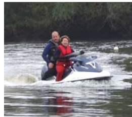
Jet Skiing July 2012 Kingsbury Water Park