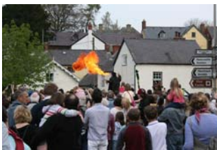
Fire Breathing!!!! Kington Weekend May 2012